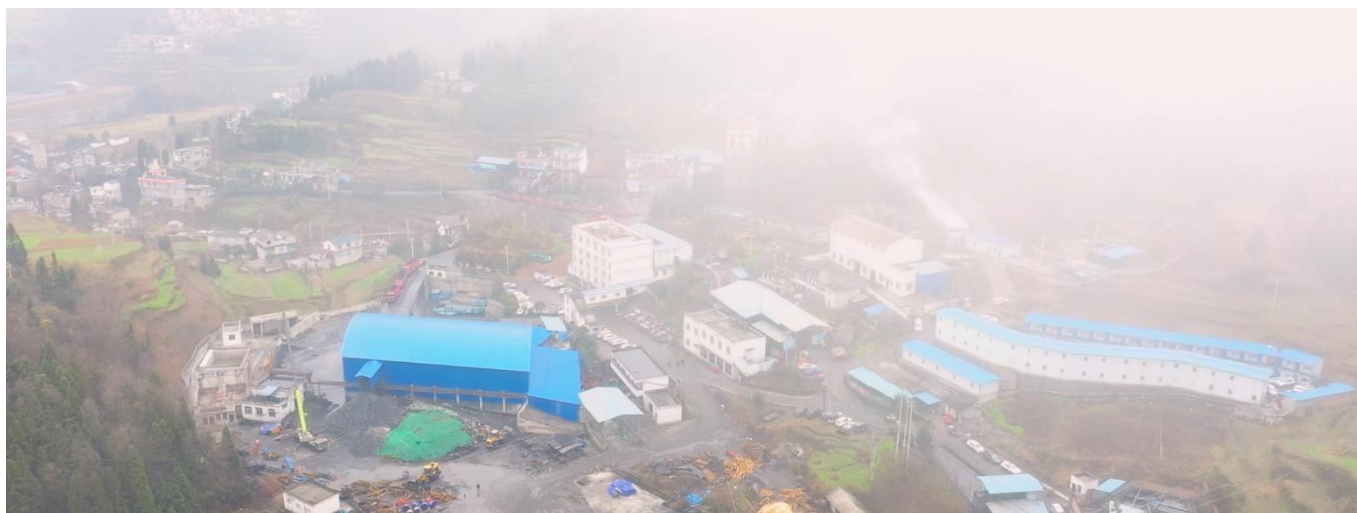
Top view of Jinhe Coal Mine

On September 7, 2023, The lowering of comprehensive mining supports at the 11206 mining face of Jinhe Coal Mine will provide strong support for the company's production in the fourth quarter.